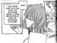
But they still will respect you. They're students and you're a teacher.

YOU WERE JUST IN A [HE CAN'T DO ANYTHING ABOUT LIVING SEPARATELY] KIND OF DOWNLOD ATTITUDE!